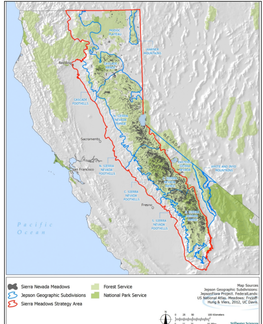
Figure 1. Sierra Meadows Strategy area.

Projects must be located within the boundaries of the Sierra Meadows Strategy geography (Figure 1).